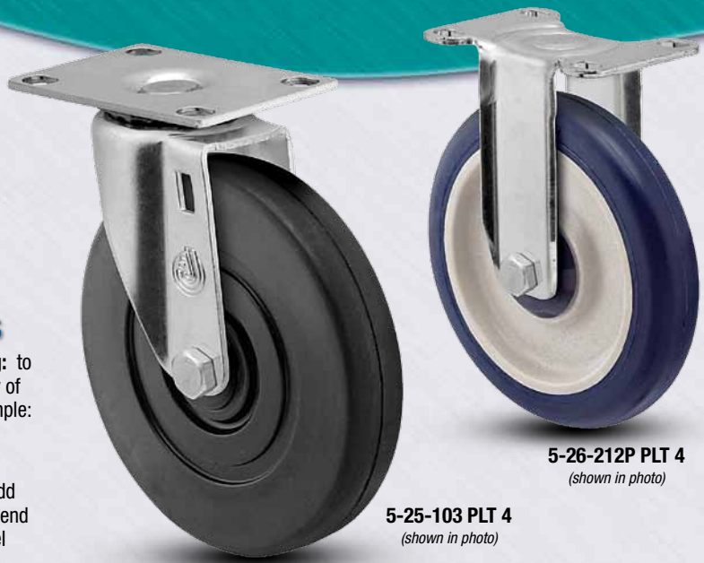
5-26-212P PLT 4 (shown in photo)