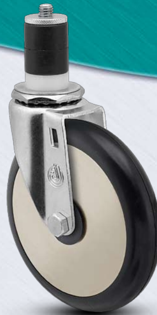
5-27-433 19A (shown in photo)