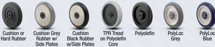
Cushion or Hard Rubber