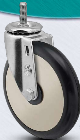
5-13-433 STEM 1 (shown in photo)