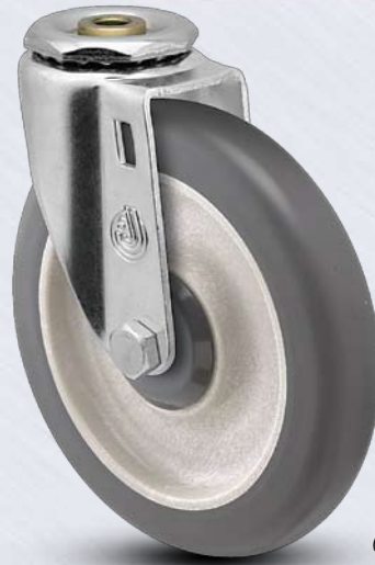
5-28-212G (shown in photo)