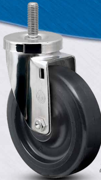
5-S36-513 (shown in photo)