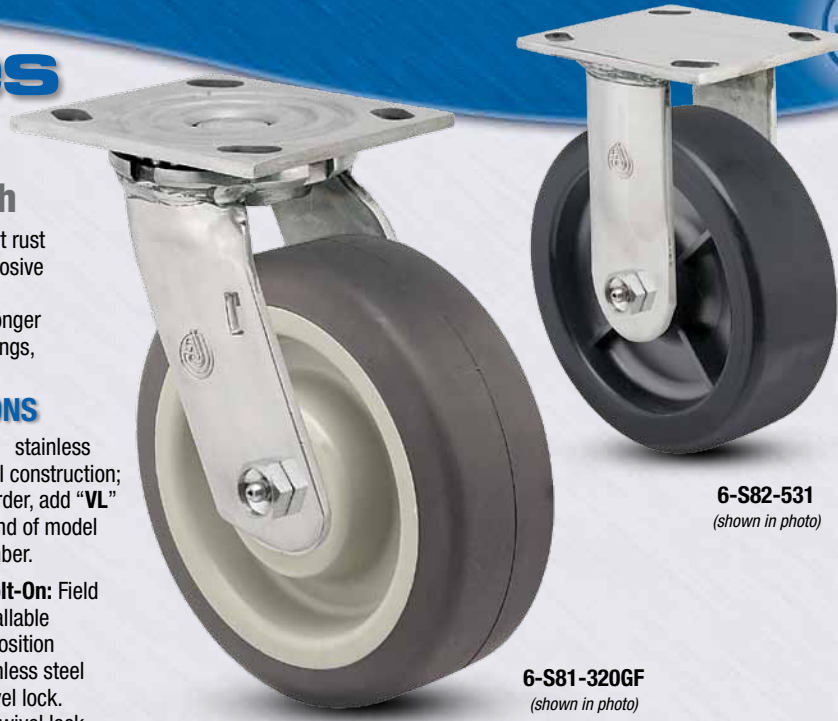
6-S82-531 (shown in photo)