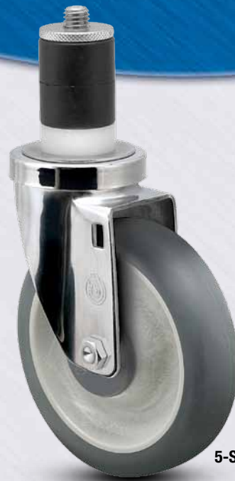
5-S40-214GD 19A (shown in photo)