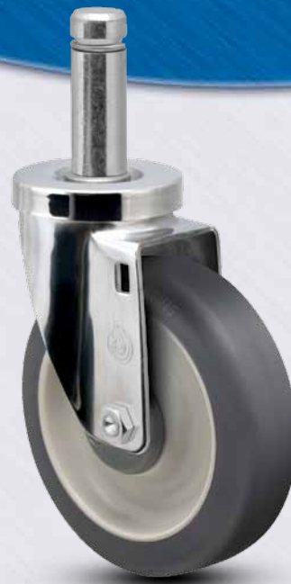
5-S34-214G (shown in photo)