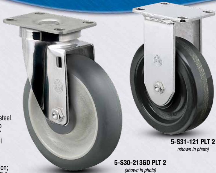
5-S31-121 PLT 2 (shown in photo)