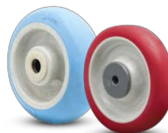
Round tread models also available ... consult factory.